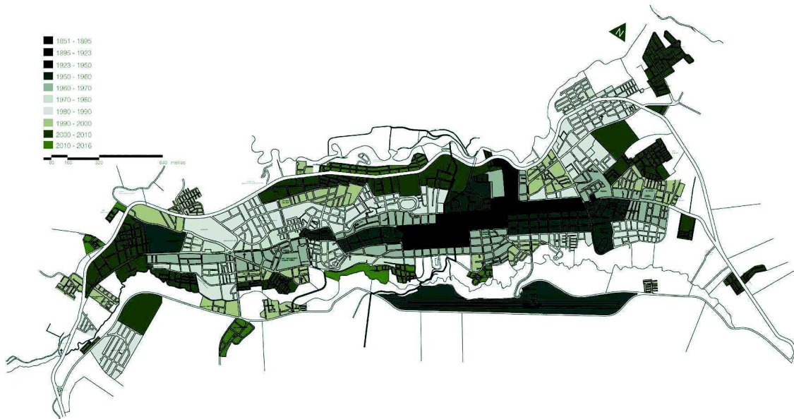
Figure 2. Urban growth plan.

of land generating as well as happens in big cities, new needs.