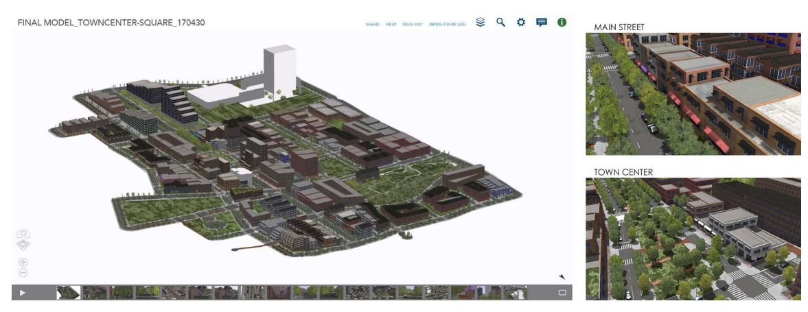
Figure 4. CityEngine allowed the class to create a large-scale model with details to render future urban design solutions.