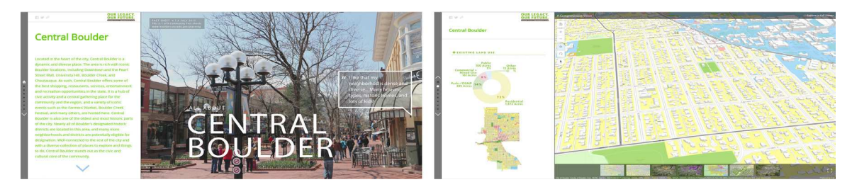
Figure 2. Central Boulder in Colorado created a story map to publicize city's images (left) and conduct growth factors analysis, such as land use in relation to building massing (right).

A series of basemaps were constructed by combining GIS datasets in both ArcMap and ArcGIS Pro to create a digital representation of the existing urban structure for both two cities. The datasets used in these basemaps included