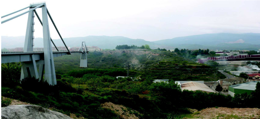
Figure 4 View of unbuilt Northern bridge defining a horizontal service plane of the city.

the arrival at the hospital. The creation of the new bridge as the northern access respects the valley and affirms the level of the service plan of the city giving continuity to that particular atmosphere that the bridges generate.