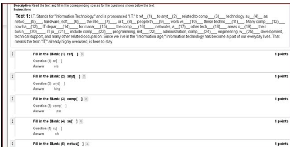
Figure 1: C-Test build in Blackboard.

In 2011, I created an Online C-Test within the Blackboard learning platform when required by my Australian university (James Cook University) to assess the academic language proficiency of a large group (93) of Chinese undergraduate I.T. students studying at a Beijing university on a course provided by my university and in English medium. Through an external quality audit by the Australian Universities Quality Agency (AUQA), concern had been raised at the level of English demonstrated by some students, and my university wished to assess English language levels. Although students were required to have reached an IELTS overall 5 score, or its equivalent, to enter the course, concern had been raised that a large proportion of the 1st year cohort were not functioning acceptably in the learning and teaching medium of English. I was required to design and provide an English language competency test that could be administered efficiently, and did so using a C-Test construct in Blackboard, with four texts sourced from the 1st year IT syllabus.