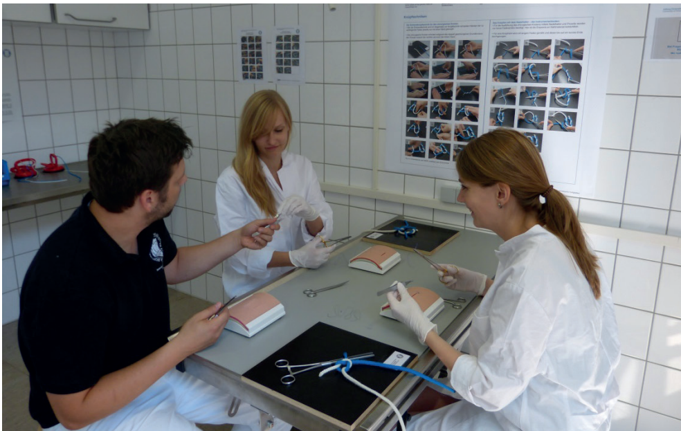
Figure 1. Students learning to suture and tie knots using simple models in the clinical skills laboratory at the University of Veterinary Medicine Hannover, Germany.

A growing array of models and simulators have been developed by veterinary educators (Scalese and Issenberg, 2005; Baillie, 2007; Fox et al. , 2013; Gerke, et al. , 2015). These are often housed in a purpose built room or centre, the clinical skills laboratory (Figure 1), which provides a venue for teaching practical sessions and a place where students can practise repeatedly and develop proficiency in a safe environment. Ideally students should be able to customise their learning and address any deficiencies in a timely manner, for example it is helpful to be able to practise suturing and knot tying on models prior to a surgery rotation. Clinical skills laboratories are often used to run assessments (May and Head, 2010) providing an ideal venue for an objective structured clinical examination (OSCE) circuit (Figure 2). Equipping students with both practical and clinical skills prior to working with live animals will also promote animal welfare.