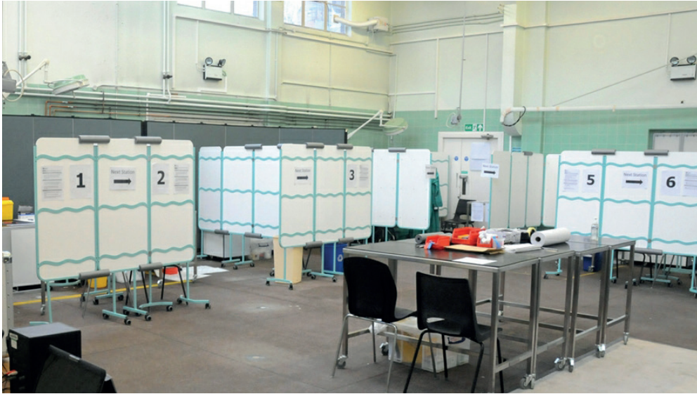
Figure 2. Stations set up for an objective structured clinical examination (OSCE) in the clinical skills laboratory at the School of Veterinary Sciences, University of Bristol, UK.