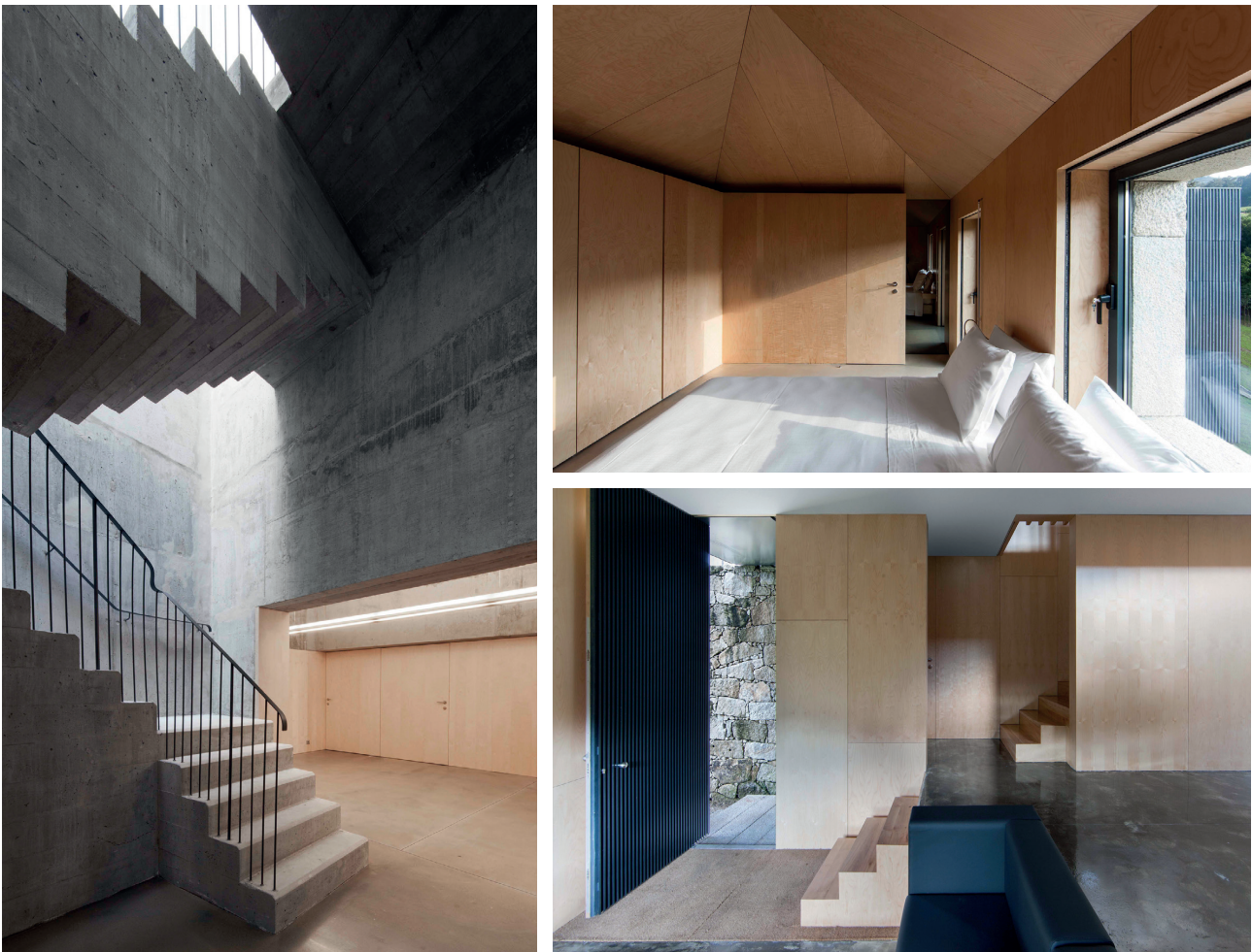
Figure 4. Interior concrete staircase connecting, via the buried volume, both rehabilitated volume and new one; interiors in wood contrasting with the concrete and stone. Correia/Ragazzi Arquitectos. 2016.

of the exterior, are in wood (fig. 4). We understand that to “conceive is not to invent (...) the work of architecture - of art, in general - acquires historical meaning by the way of responding to the system or to the aesthetic systems characteristic of the time in which it appears.” 3