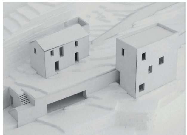
Figure 1. Model and sketch drawing of the proposal. Author drawing, 2013.