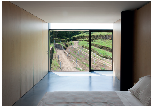
Figure 8. Buried volume: access to both volumes (houses) and winetasting room. Correia/Ragazzi Arquitectos, 2016.