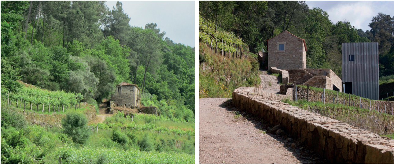
Figure 2. Before and after of the preexisting house with the new addition volume. Correia/Ragazzi Arquitectos. 2016.