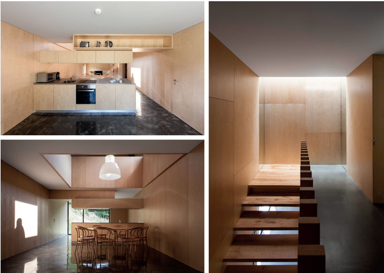
Figure 6. Interior spaces of the new volume. Correia/Ragazzi Arquitectos. 2016.

so, stone, concrete and nature coexist in what today seems to be an intervention that has always been present, that is integrative and not intrusive, in an area that seeks to be renewed and revived (fig. 9).