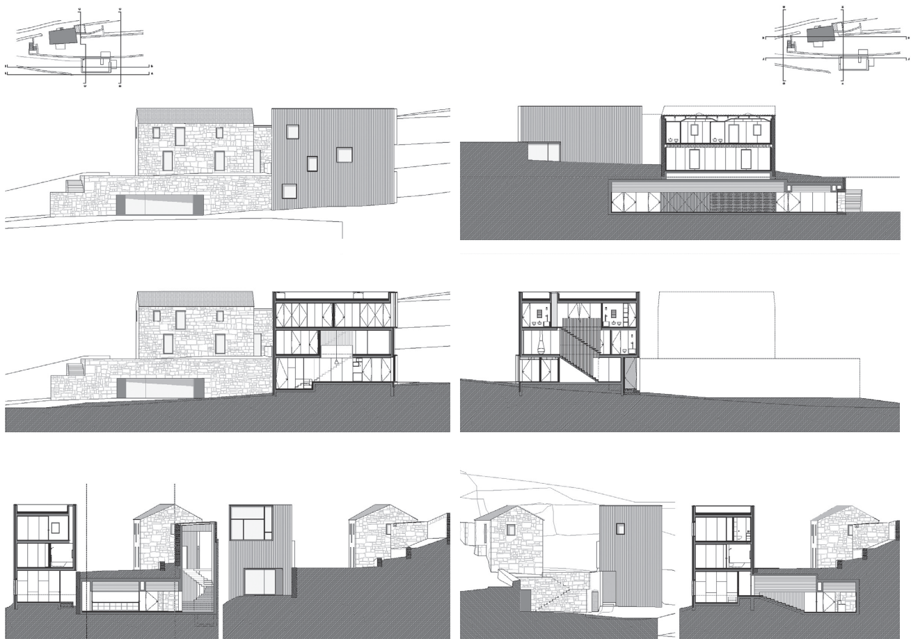
Figure 5. Longitudinal and transversal sections. ©Correia/Ragazzi Arquitectos archive.

suites. This dwelling is also accessible via the buried reception floor by stairs.