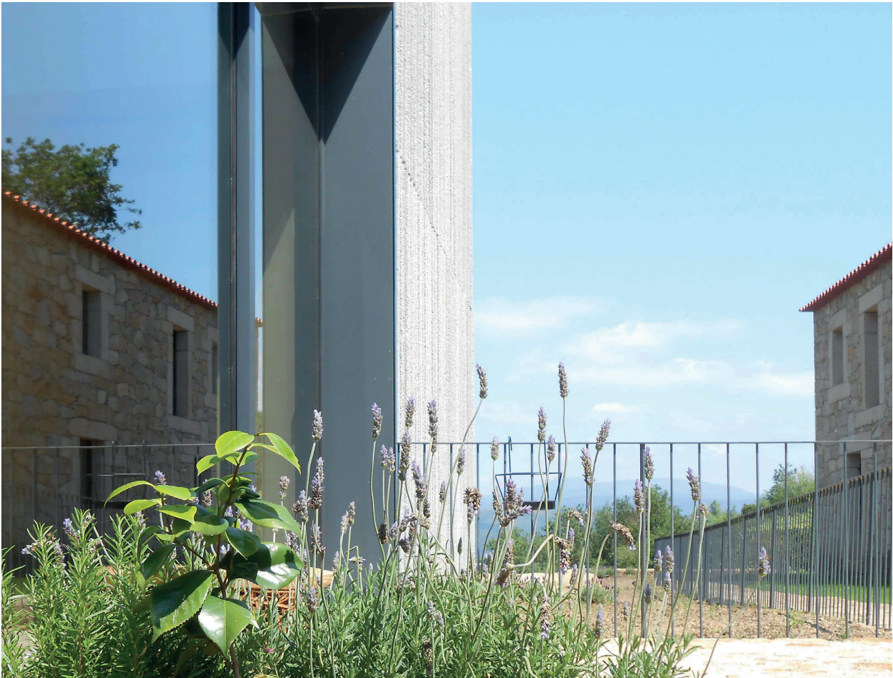
Figure 3. In-between green leisure area of the new volume. Correia/Ragazzi Arquitectos. 2016.