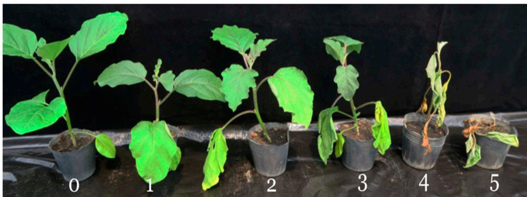
Figure 1. Disease rating scale 0–5 according to [35], where 0 = no symptoms, 1 = only one leaf partially wilted, 2 = two or three leaves wilted, 3 = all leaves except two or three wilted, 4 = all leaves wilted, and 5 = plant dead.