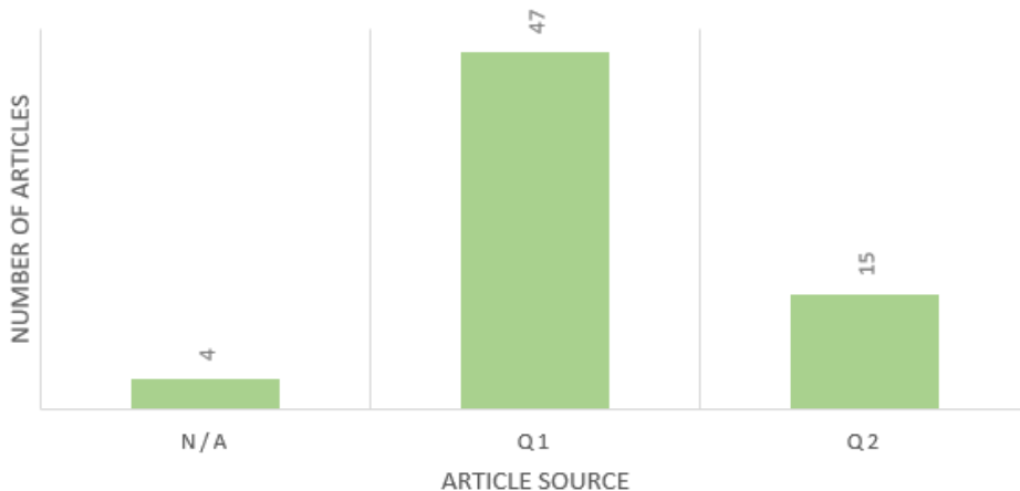
Figure 3. Number of articles by source ranking.

correspond to a single Government issued paper from a specialist on Domestic Security from the U.S. Congressional Research Service.