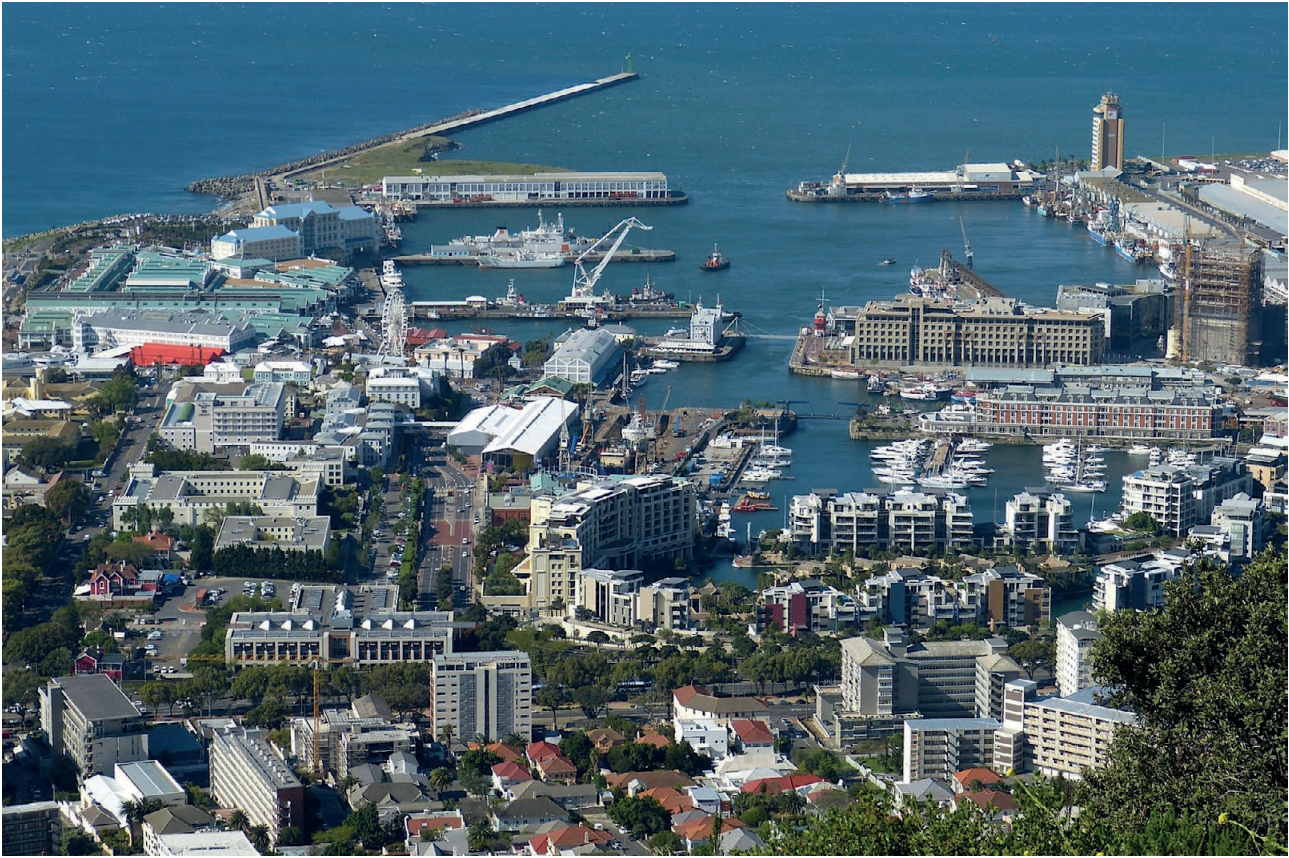
Figure 3 | V&A Waterfront in Cape Town.

In accordance with the city development model developed by Foster+Partners back in 1994, the inner harbor of the port of Duisburg is being systematically transformed, the post-industrial section of which was the largest transportation point from the Ruhr coal mines.