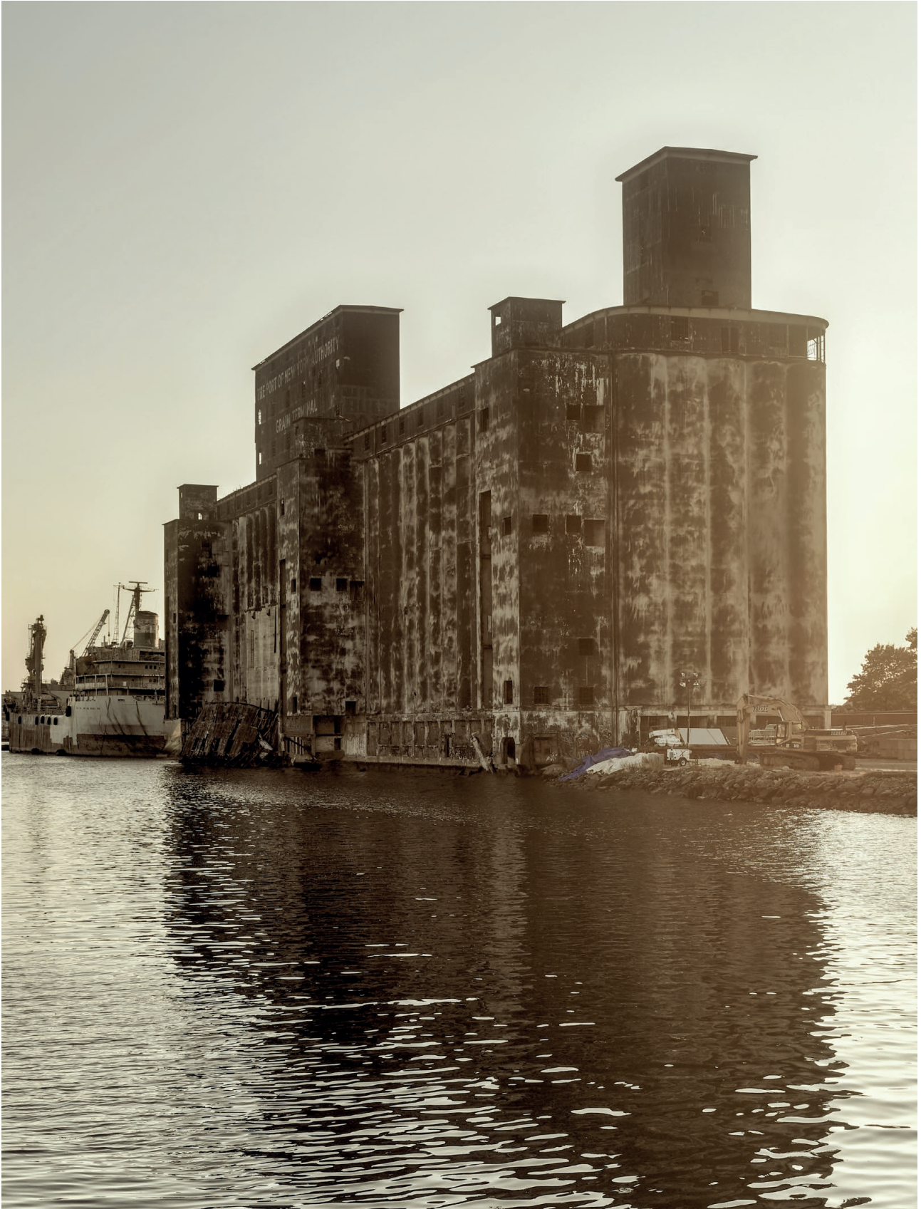
Figure 2 | Red Hook Grain Terminal, New York.