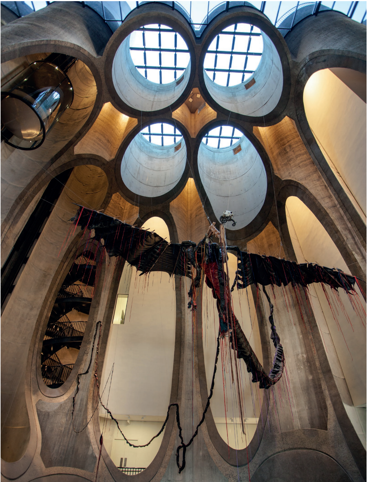
Figure 6 | Light through the slots of the Zeitz Museum of Contemporary Art Africa (MOCAA), Cape Town.