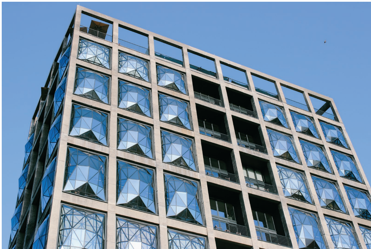
Figure 7 | The pillowed glass glazing panels in the façade, Zeitz MOCAA silo.

and inspires to search for adaptation methods. Architect T. Heatherwick creatively rethought the transformation of the 42 tubes of the grain bin complex into exhibition halls. “Rather than strip out the evidence of the building’s industrial heritage, we wanted to find a way to enjoy and celebrate it. We could either fight a building made of concrete tubes or enjoy its tube-iness.” (Frearson, 2011).