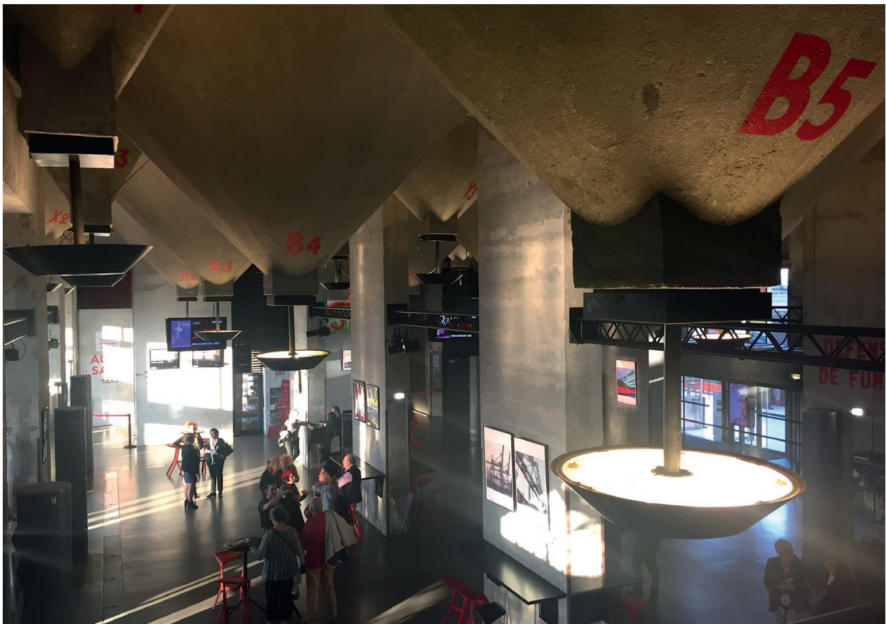
Figure 4 | Foyer of the Silo d'Arenc, Marseille.

The subsequent adaptation of old docks, warehouses and port areas of London, Baltimore, Rotherdam to prestigious areas have become textbook examples of innovative branding projects. Further social and technological changes showed a huge potential for the development of post-industrial areas and their elements. In the process of urban renewal, the original function of industrial buildings fades away, but the volume itself continues to belong to it, and the rationality of the building logic captures the imagination and vividly demonstrates its strength in the urban landscape. D. Heymann, in his study of the architectural and sculptural presence of the silent towers in the landscape, defines their meaning as "campanile of the American Midwest." He also noted the paradox of the presence of these dynamic aggressive forms that support, rather than violate, the integrity of landscapes (Heymann, 2013). In accordance with the approaches to determining the value of A. Riegl monuments, the monumental forms of elevators can be classified as "unintentional monument (Ungewollte Denkmal)" (Riegl, 2021). They are really monuments of their time, engineering thought, technology and materials.