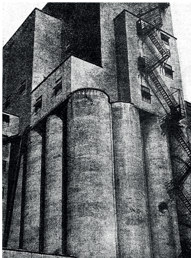
Figure 1 | Chicago.

mountain-like” elevators in Buffalo and Chicago made an indelible impression on the architect E. Mendelssohn (Figure 1).