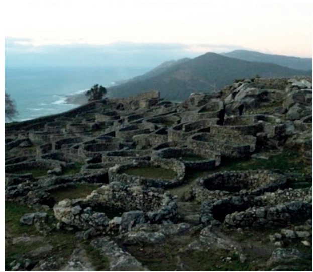
Figure 2 | Santa Tegra, ruins of a Celtic, settlement unit, photo M. Urbańska.

Placing the settlements on elevated terrain made it possible to control the movement of people and animals on the slopes and events at a great distance from the observation site. Additionally, there are many springs in the mountains of the analysed region. The location of the settlements also depended on watercourses - covering its beginning, it provided the inhabitants with access to