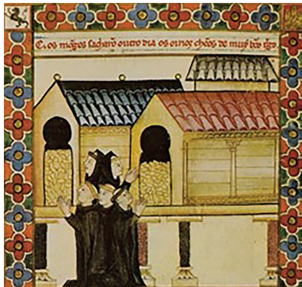
Figure 4 | Granaries depicted in Galician manuscript Cantigas de Santa Maria , 1280 AD.

The popularization of the form was related to the increased cultivation of maize started in the 17th century, which transformed the agricultural landscape and changed the use of parts of crops. Corn was brought to Europe in the 16th century, after the Spanish invasions of the American continent. Described granaries are found mainly in the northern part of Portugal and in Spanish Galicia. They are made of wood and stone (mainly granite, as a commonly available construction material in this area), and their base is raised on characteristic columns. Thanks to protruding parts, pests are prevented from getting inside. Most of the granaries are made of a combination