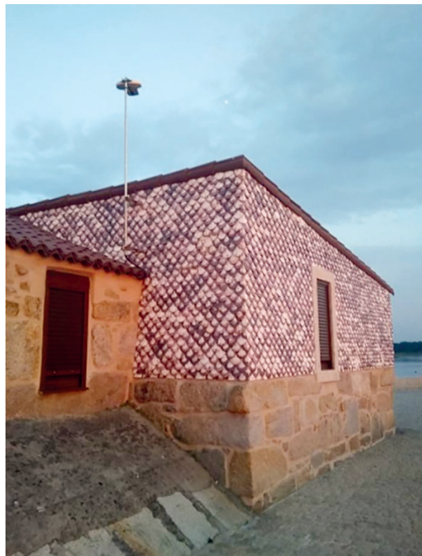
Figure 5 | Elevation made of shells, Cambados, Spain, 2019.

The sense of harmony is visible thanks to the rhythm and emphasis on elements such as door and window openings. In the granite construction, especially field and hewn stone (Figure 6) was used on the villages of the described region, while window and door openings for the construction purposes, were framed with profiled stone.