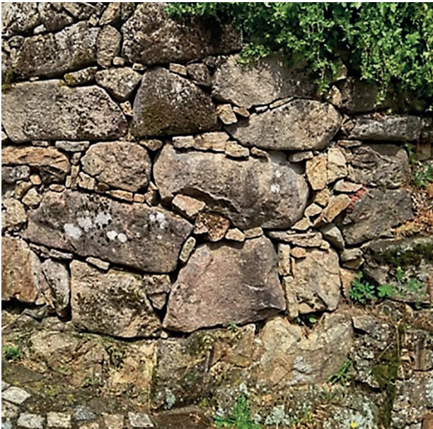
Figure 6 | Filling of space in between the big rock with small stone fragments, Porreiras, photo: M. Orsz.

materials - stone and wood, which are only accompanied by modern materials as functional complements.