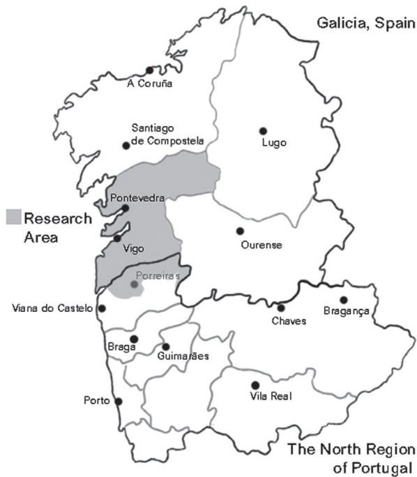
Figure 1 | Map of North Portugal and Spanish Galicia with marked researched area.

The region, where the analysed area is located, was formerly called Gallaecia and included the present northern part of Portugal from the Douro River line and the Spanish territory north of the Minho River, as well as the lands to the west of the present borders of Spanish Galicia.