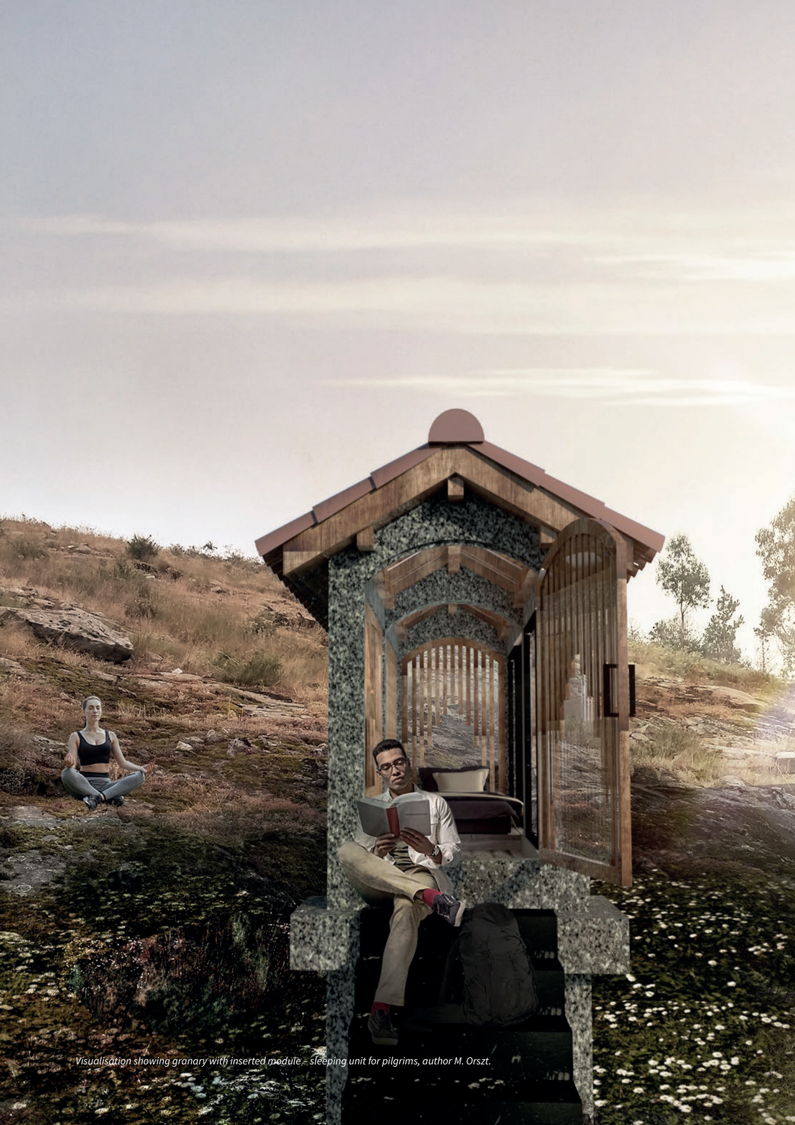
Visualisation showing granary with inserted module - sleeping unit for pilgrims, author M. Orszt.