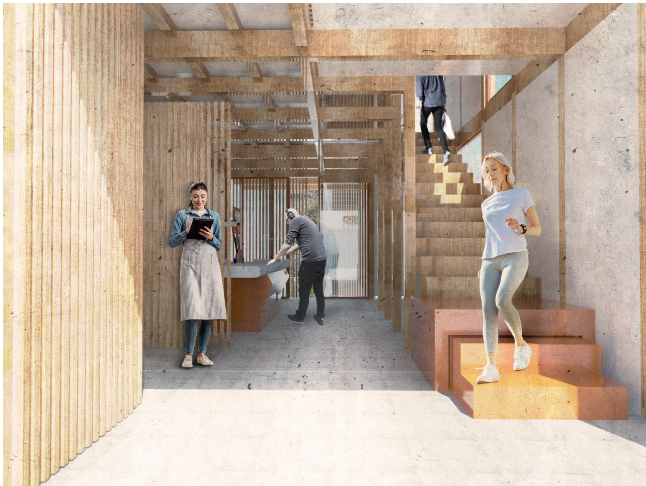
Figure 10 | Visualisation of the interior of the carpentry woodworking workshop with its wooden frame construction and eucalyptus boards wall enclosures; author M.Orszt.

the ground is uneven, foundation slabs with lightweight expanded clay aggregate insulation are used. The timber structure is separated from the foundation slab by waterproofing. In the case of timber-framed walls (made of, e.g., eucalyptus and other locally available species) in contact with stone walls, vertical waterproofing is also applied. The design goal is to build the facilities using as much recycled material as possible – as the roof finish, the tiles abandoned at the ruins can be reused. Additionally, the abundance of building materials created from natural raw materials testifies to the diverse possibilities of using eucalyptus. One of these is fibreboard made from the fibres of this tree. Self-bonding according to tests, it meets the requirements of boards for use in building interiors. The wood-based materials are planned to be developed and used in the woodworking workshop planned in the proposal (Figure 10).