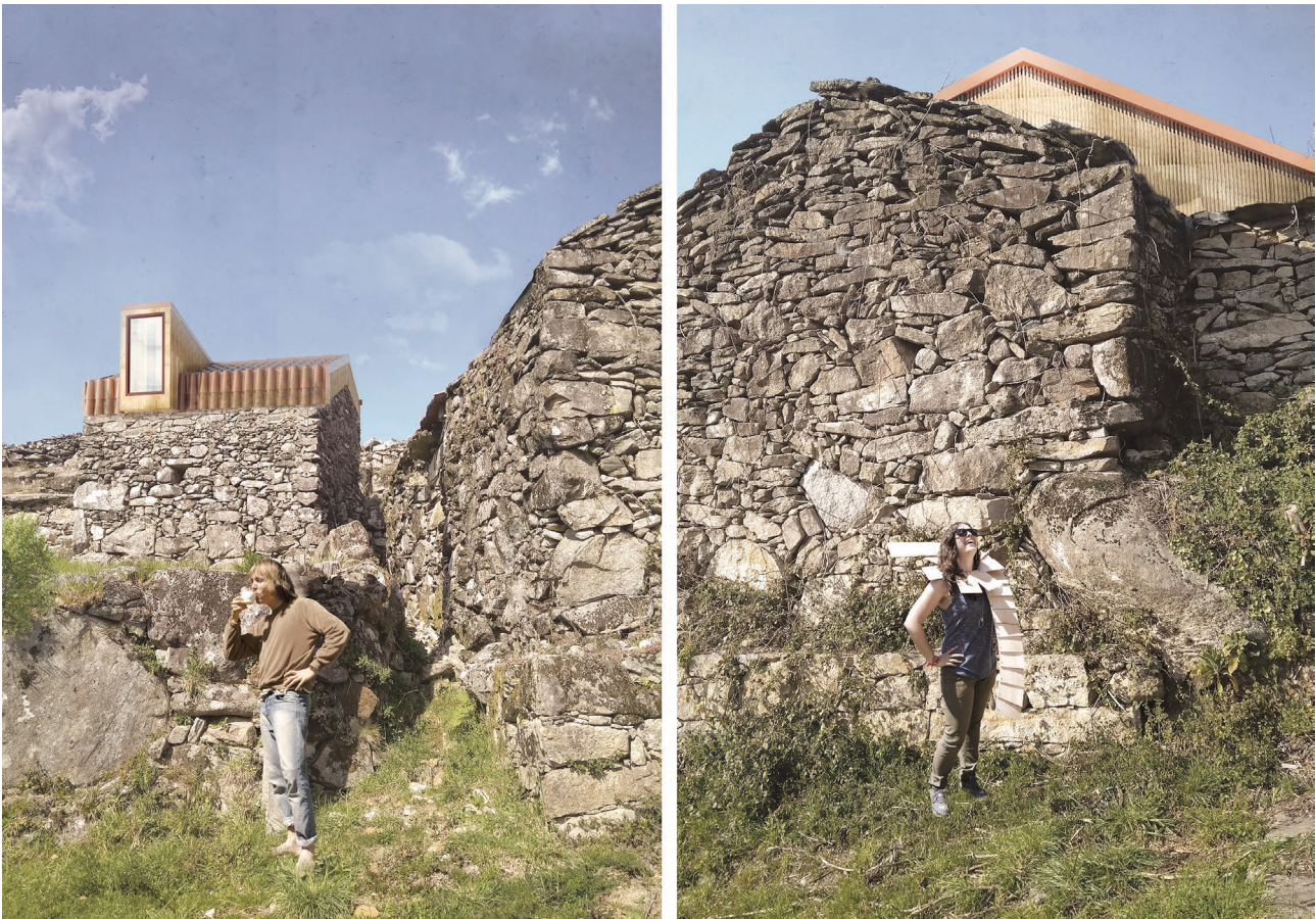
Figure 9 | Visualisation showing the albergue (left) and the ceramic workshop (right) using existing ruins as a creative footprint, author M. Orszt.

The project aims to build the image of local products as manufactured using the knowledge of generations. Porreiras agricultural products are intended to meet the nutritional needs of the villagers, as well as serve as a competitive, ecological commodity. Economic development is based on the goods present on the spot and the use of the existing potential. The possibility of implementing a system in the village based on the exchange of knowledge and experience related to the traditional cultivation of plants and construction for the strength of muscles and the work of newcomers, has its basis in dynamically developing Workaway programs. The opportunity to experience life in a landscape of historical and natural value will become a valuable service that villagers can provide.