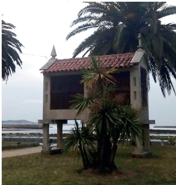
Figure 3 | Stone construction of a granary with wooden details, Cambados, fot. M. Orszat.

is stored. The granary can be made of granite stones and wooden details. The function and use of wooden details resembles the Slovak kozelec . However, it requires fewer structural elements - the wooden grates are held mainly by the weight of the surrounding stone. Based on stone pillars topped with round hewn stones (with stones extending out to prevent pests from entering the interior - Figure 3.), it consists of beams that make up the floor structure, pillars, supports and a ceramic-tiled roof. The walls of the granary are approximately 25 cm thick, and the standard surface area is a minimum of 5 m 2 . If there are stairs in front of the block, they are a separate form, most often with a few hewn stones to get to the espigueiro . Sometimes the gable crowning the granary has a religious form.