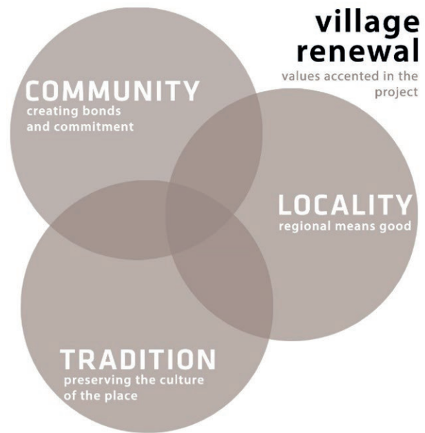
Figure 7 | Core values of the project, author M.Orsz.

The characteristic scale and spatial context of the village influenced the dimensions of the proposed