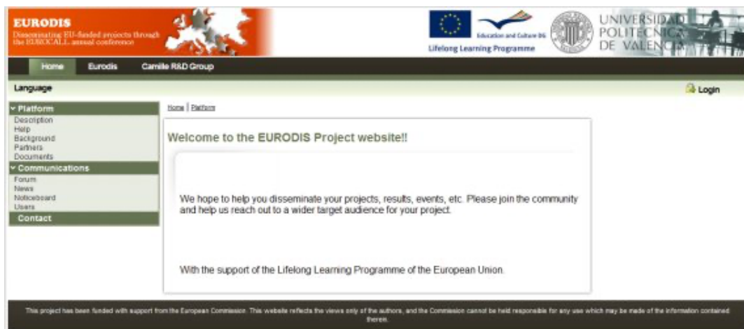
Figure 1. The EURODIS homepage.

The EURODIS website comprises a comprehensive database –created by registered users who submit the information– of ICT-based projects, most of which (but not solely) have been funded by the European Commission's Lifelong Learning Programme which is managed by the Education, Audiovisual and Culture Executive Agency. The website offers the language learning and teaching community at large a place to locate potential project partners, newly developed language learning resources, events, the establishment of a community of practice, a network devoted to CALL where advice can be sought from colleagues, etc.