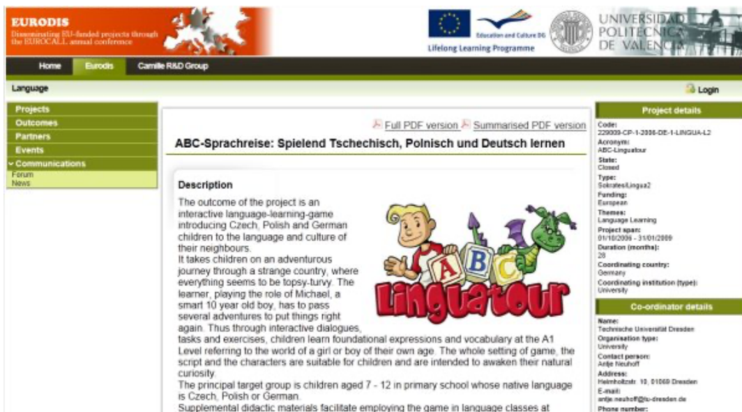
Figure 6. Sample project screen.

The following is a partial sample screen capture taken from one of the projects in the EURODIS database. As we can see, both a summarised and a full version PDF file with the project information is available, as well as the HTML version. The right hand side of the screen offers a short version of the basic project information and the co-ordinator's details for a quick reference.