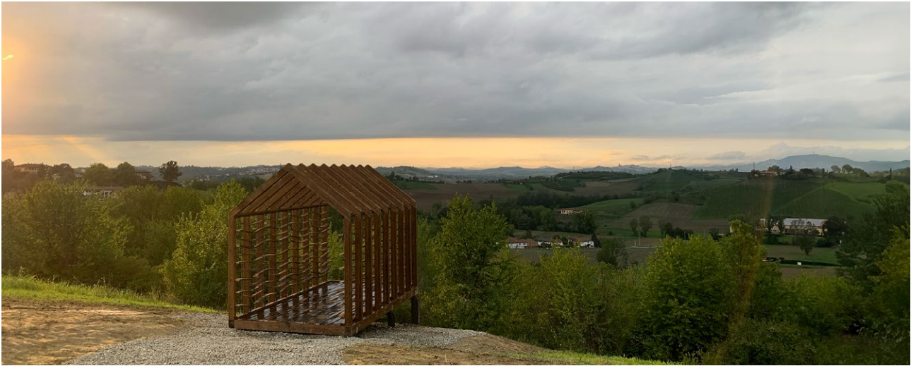
Figure 1 | The CiaBOT and the UNESCO World Heritage landscape of the Monferrato hills (AT, Italy).

Understanding among Politecnico di Torino (Department of Architecture and Design) and small and medium-sized Portacomaro's enterprises, interested in promoting land valorisation strategies based on a circular economy approach and the optimization of waste as a resource.