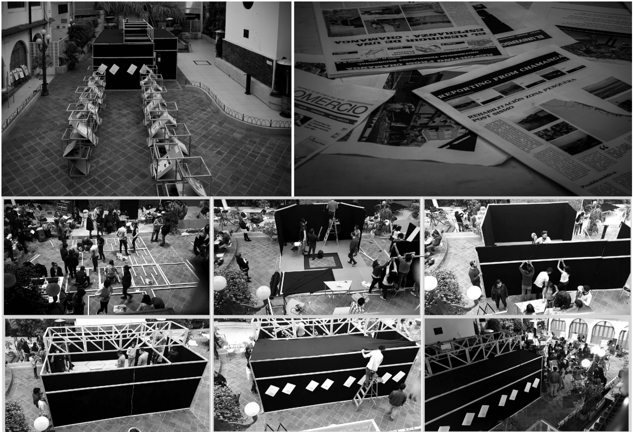
Figure 4. 2016, WinAReQ – Reporting from Chamanga.

A few months after the workshop, in September, more in-depth contextual mapping studies had already been carried out, which led to the definition of six identity zones in Chamanga itself. This zoning highlighted their fragmented territorial structure.