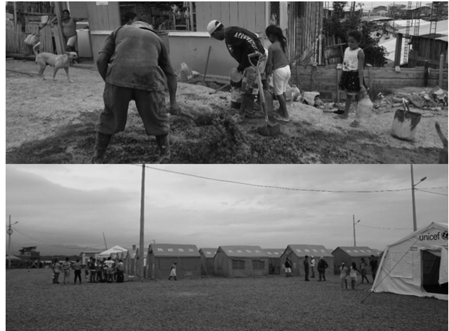
Figure 3. The reconstruction process: housing under construction with the same deficiencies as those destroyed by the earthquake and emergency shelter provided by the government, Chamanga, Ecuador

Consequently, the importance of pre-design concerning the study of the identity of the place became evident. The design phase had to be based on a coherent analysis of the identity context to respect the users and the spatial value. This was only possible if the duality of the pre-design also considered the tradition, the memory, and the future projection of those who lived in that particular context.