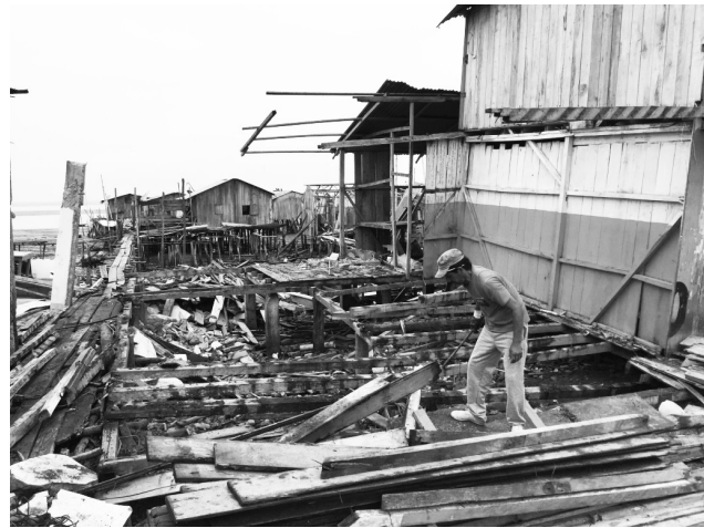
Figure 2. Chamanga, 2016

On April 16, 2016, an earthquake measuring 7.8 on the Richter scale was recorded in the coastal area of Ecuador. The event was immediately perceived with all its gravity due to the magnitude and seriousness of the events. There was immense material and immaterial damage and a significant number of deaths. The fragile construction reality was undoubtedly evident, and the inability to respond with adequate disaster management worsened an already difficult situation. The provinces of Manabí (the epicenter was in Pedernales) and Esmeraldas were the worst affected. Between these two provinces, a village was almost destroyed: Chamanga, a town that, until then, hardly anyone knew or considered relevant (see Figure 2).