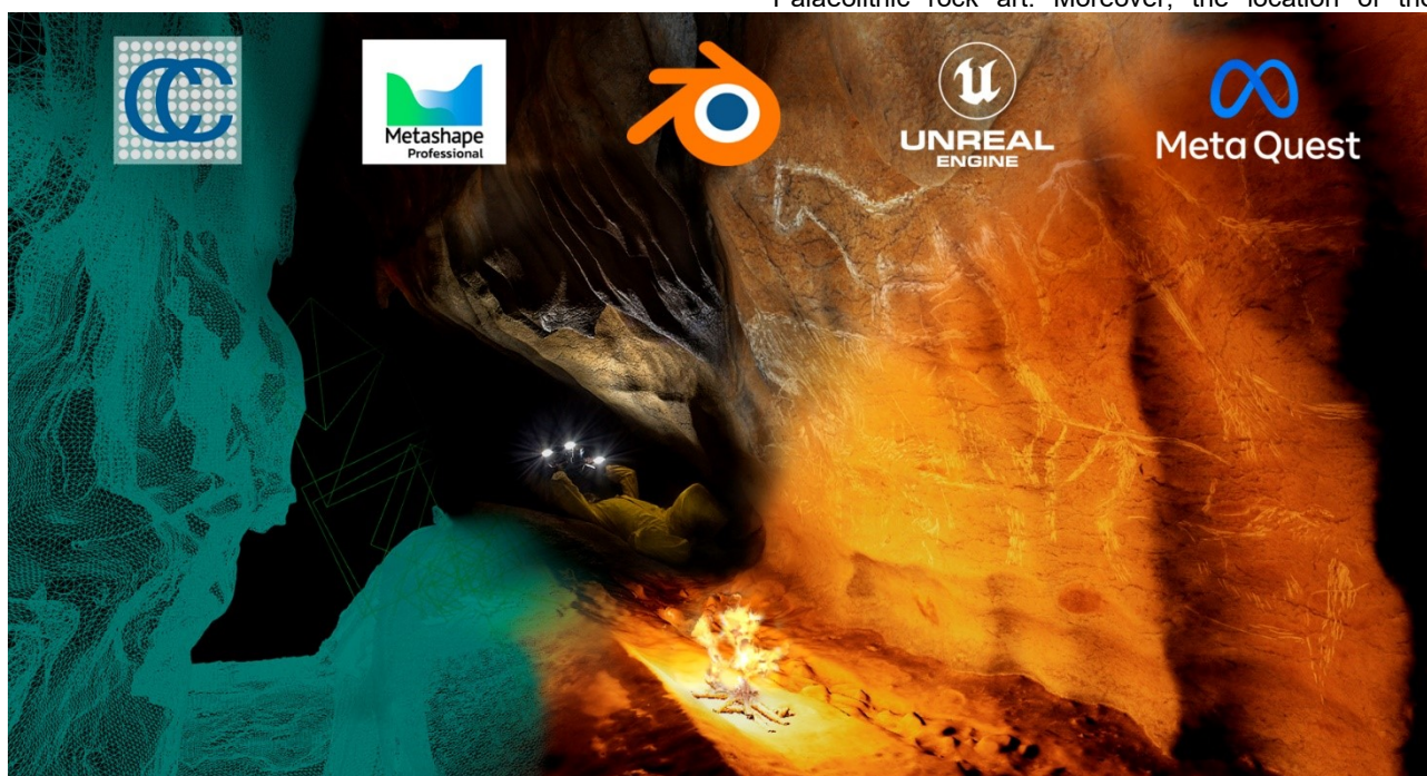
Figure 3: Visual synthesis of the virtualisation workflow. From photogrammetry and laser scanning to virtual restoration and lighting, and integration into the graphics engine.

In this way, archaeological remains such as flint tools used to engrave motifs are closely linked to artistic production. However, other traces, such as charcoal remains, reddened clay, or thermal alterations in the rock, reveal actions that could have been intrinsically related to the artwork, although they may not be as evident at first glance and may be linked to different phases of visitation. This is why all remains found in the site are a potential source of historical information to reconstruct the context of the creation/viewing of Palaeolithic rock art. Moreover, the location of the