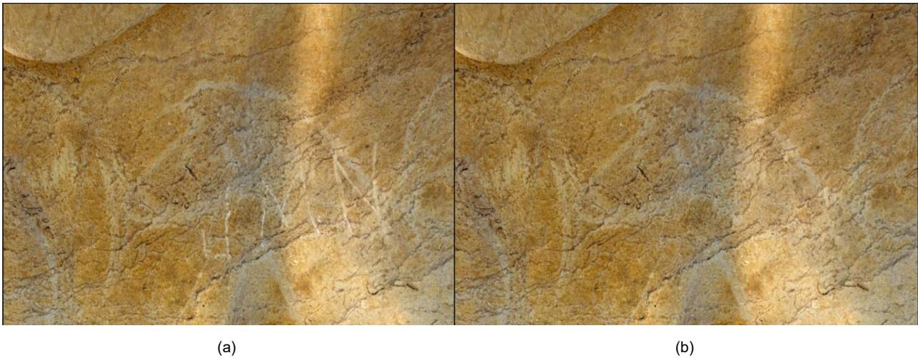
Figure 2: Examples of before (a) and after (b) virtual restoration of prehistoric glyphs, digitally removing modern graffiti.

(IAC, henceforth) (Clottes, 1993), it has only been in more recent times that a shift has occurred in the approach to studying activities surrounding Palaeolithic rock art, based on quantifiable data (Fazenda et al. , 2017; Díaz-Andreu & Mattioli, 2019; Till, 2019; Medina-Alcaide, 2019; Jouteau et al. , 2020; Fritz et al. , 2021). This shift in research trend pays more attention to information from the context in which graphic manifestations are integrated (Medina-Alcaide et al. , 2018), thus allowing the study of the artistic phenomenon in terms of sensory perception, as well as its economic and social implications, and not solely from a stylistic point of view (Garate, 2017; de Beaune, 2018).