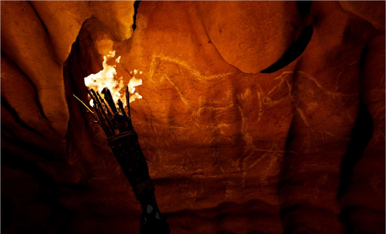
Figure 4: View of the real-time experience in SVR with using interactive torch lighting.

The first recreated lighting system is a torch (Fig. 4), corresponding to a small portion of reddened clay juxtaposed with charcoal remains found during the archaeological excavation of the ledge. Its small size and elongated shape (8.6 cm x 2.6 cm) suggest its use as a support for a torch or the combustion of a detached fragment from it. The torch becomes an interactive element for the viewer, as the VR user can hold and move it while traversing the ledge, thereby varying the environmental lighting in real time. This allows us to experience the actual visibility provided by the lighting systems used by the artists who decorated the cave of Atxurra.