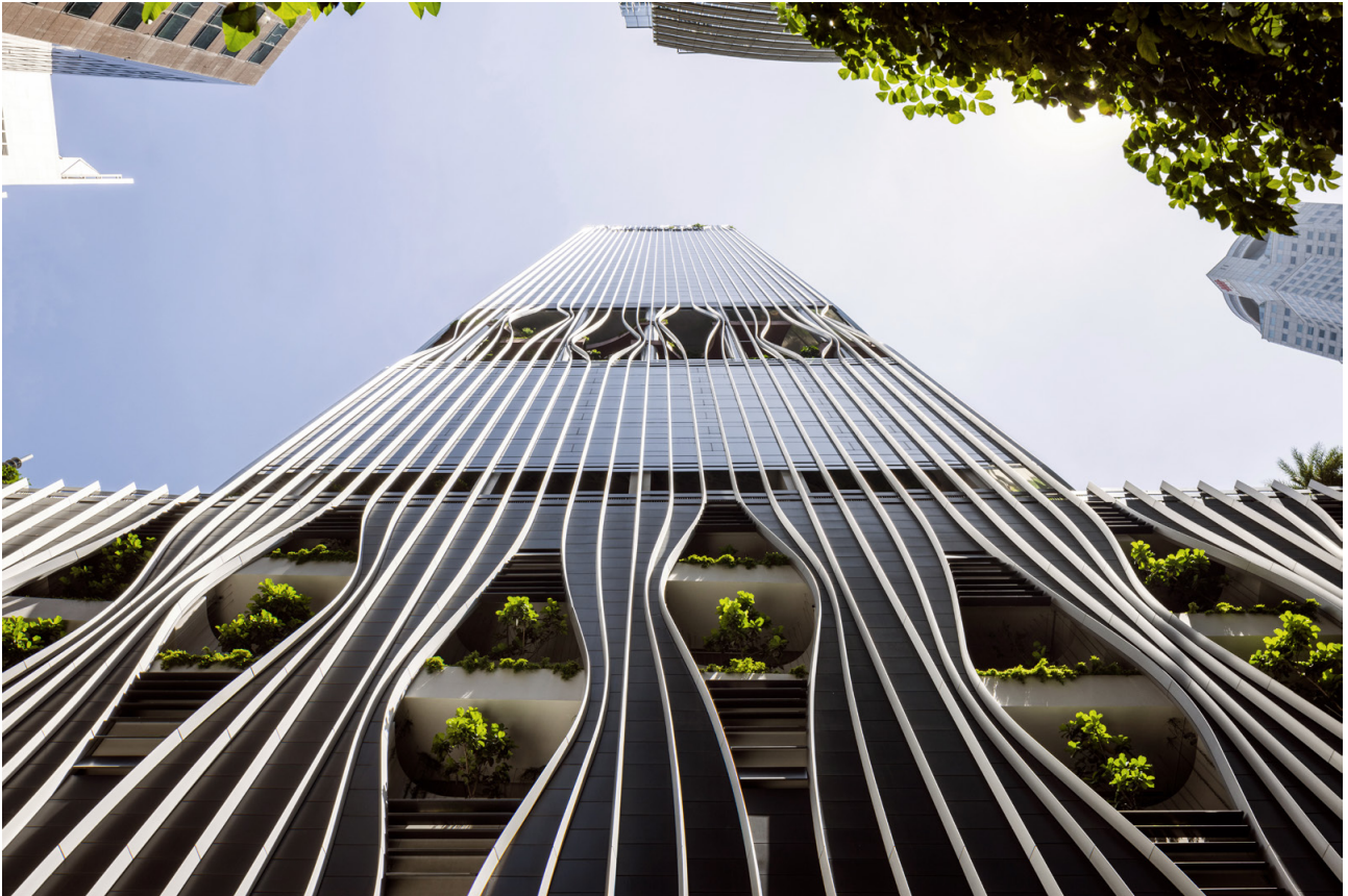
Figure 1 | CapitaSpring Tower, Singapore, CRA Associates Studio.

design proposals, inspired by a definition of ‘intelligence’ as the ability to adapt to the environment from a limited stock of resources, knowledge or power. The dialogue between the intelligences is the core of the argument. We must think of a notion of intelligence that is distributed and rooted in people, in their creativity and adaptability. You make a good point: today we are too focused on the idea of Artificial Intelligence (and specifically ChatGPT): but this artificial intelligence will not be enough on its own. It will perhaps be able, a few years from now, to move from Text-To-Image to Text-To-Bim, helping us to realize complete projects by taking away the charge of the most boring and repetitive jobs. Let us remember, however, that Artificial Intelligence can only reproduce what already exists. It can never create what is not yet there. This is why intelligence must not replace but complement each other.