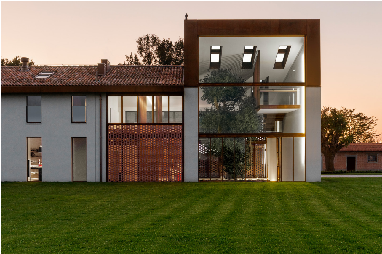
Figure 5 | The Greenary. Parma, Italy. CRA Associates.

urban ecosystems for the community. An example of how we can use renewable energy to create resilient infrastructure and public spaces.