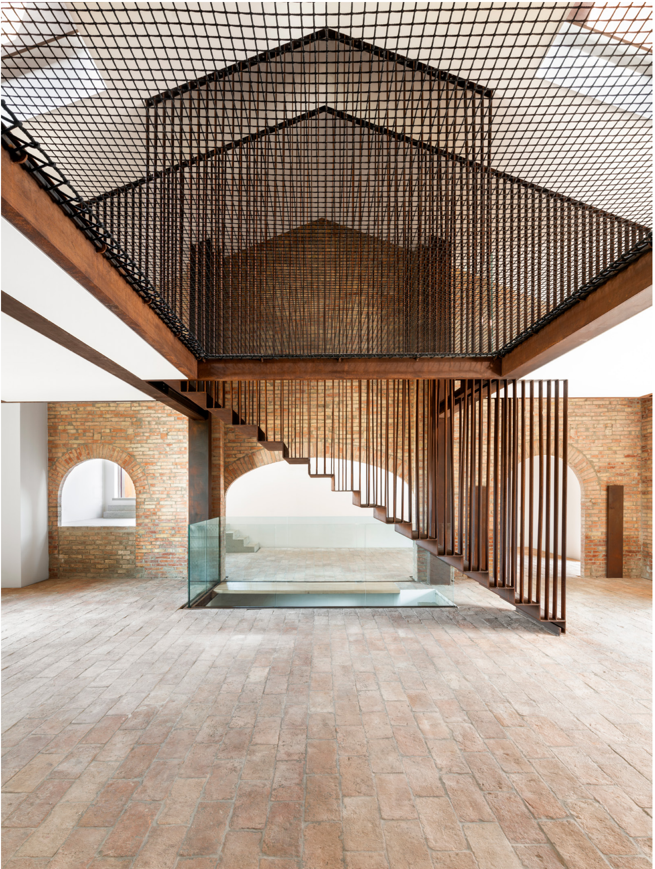
Figure 4 | The Greenary. Parma, Italy. CRA Associates.