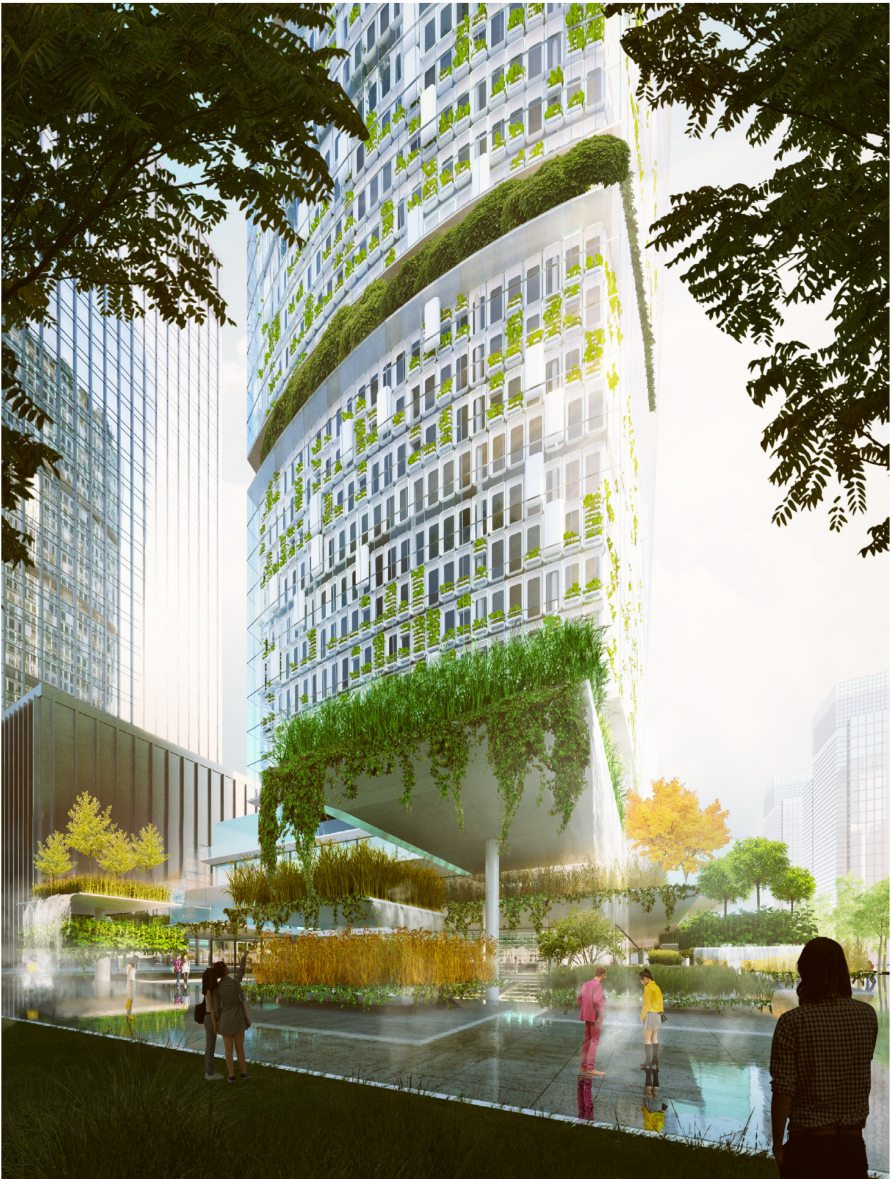
Figure 2 | Jian Mu Tower Shenzhen, China. Credits: CRA-Carlo Ratti Associati.