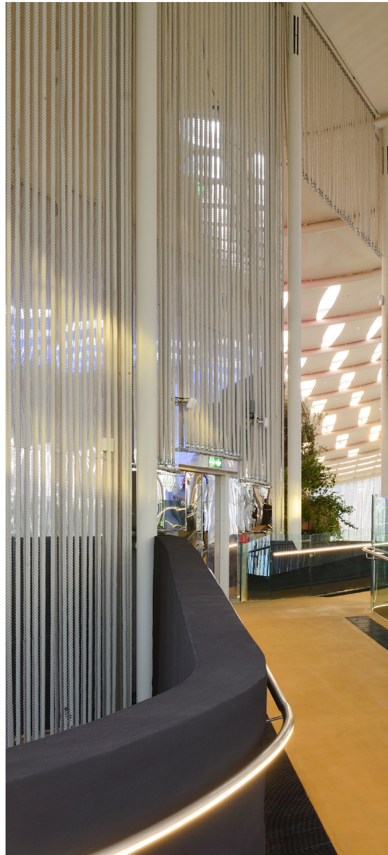
Figure 6 | Italian Pavilion at Expo Dubai 2020 (Credits: Michele Nastasi).

CR: Italo was a great innovator, one of those rare designers capable not only of providing new answers but also of asking new questions, which, in our profession, is the key to continuing to innovate. With Italo, we imagined a pavilion, the one at Expo Dubai, in which the elements of nature and even the waste of human activity would become an element of value in a perspective of circularity: from coffee grounds to orange peels, passing through the recycled plastic ropes that naturally conditioned the space by reusing two million bottles. The fabric of start-ups in Italy is rich and I think the best opportunities are yet to be discovered. But from companies working with waste materials to produce new objects (think of rice husks that can also become garment fabric) to those experimenting with large-scale 3D printing, we can really put the Italian genius, that of globalization that I call niche - that is, the ability to create unique and excellent products capable of competing in the global market