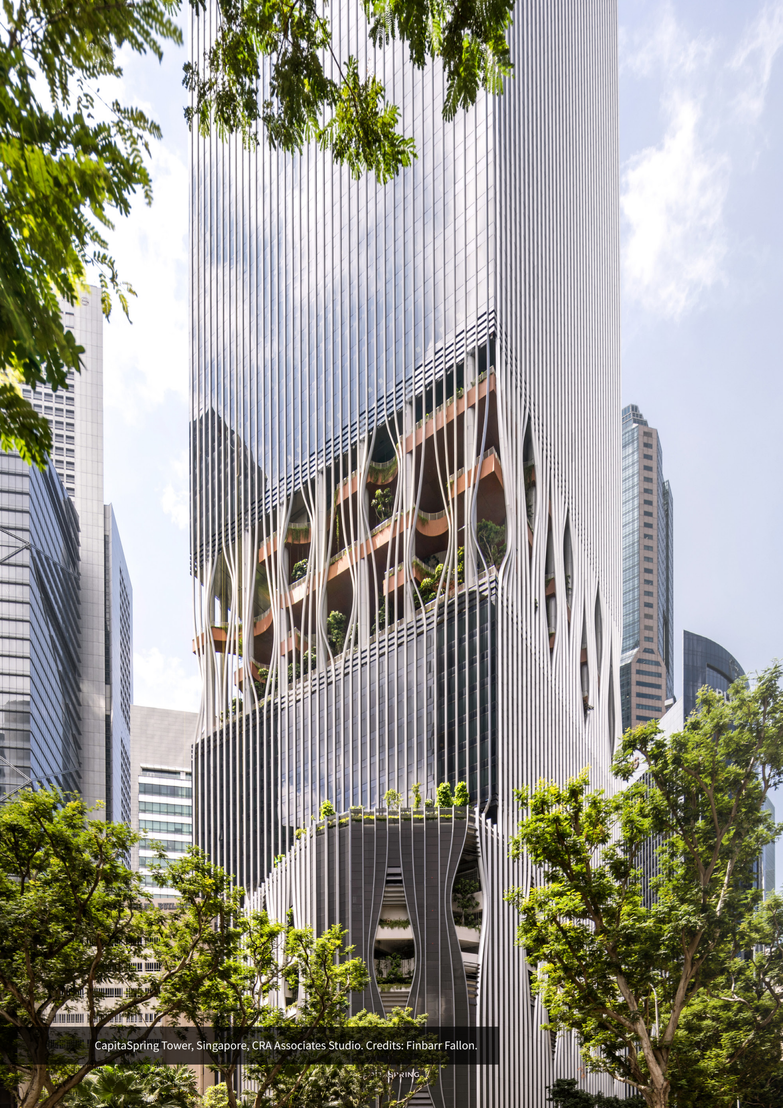
CapitaSpring Tower, Singapore, CRA Associates Studio.