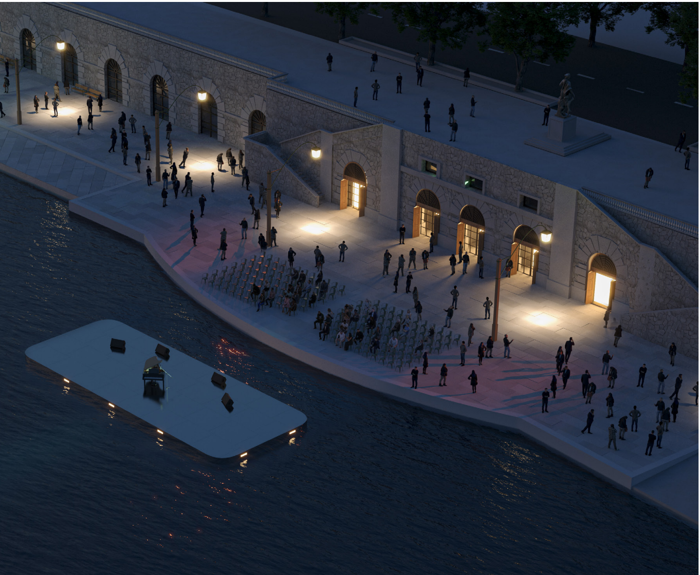
Figure 8 | Floating Above the Floods, River center, Murazzi del Po, Torino, Italy. Credits CRA Associates.

natural light and reducing energy consumption. We decided to think of a transparent and open ground floor to promote what is central for us: the meeting between people and transforming the closed physical space into a common ground. Let us remember that only from the encounter between people can true innovation be born.