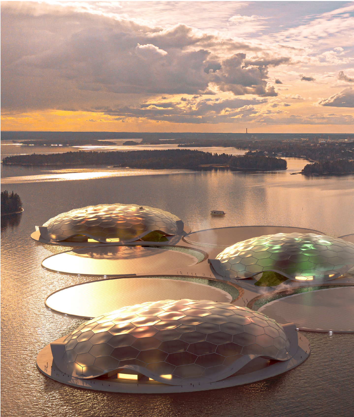
Figure 3 | Hot Heart. Helsinki, Finland. CRA Associates.