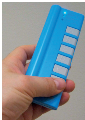
Figure 1. Clicker used in the current study.