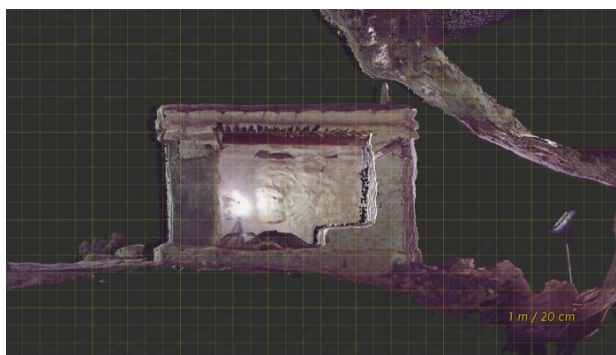
Figure 2: Side-view section of shrine in Cueva de Oratorio.