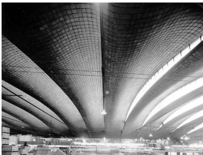
Figure 5. Gaussian vault. Eladio Dieste.

One of these new shell forms are the so called Gaussian vaults (Figure 5), whose cross sections are defined by a series of catenary arches of varying height, springing from two straight parallel lateral edges supporting the vault. Longitudinal sections are undulating lines of varying amplitude from maximum at mid-span to zero at the supporting lateral edges. The resulting geometry is a doubly curved surface, a most appropriate form to stiffen the thin shell and prevent buckling. Double curvature with both synclastic and anticlastic areas in the same surface is therefore the form structuring principle adopted by Dieste for this new material (reinforced brick masonry) to achieve not only strength, but also most suitable rainwater drainage in the lower anticlastic areas. This principle also allows the possibility to design a discontinuous roof with separate slices so as to provide skylights between them.