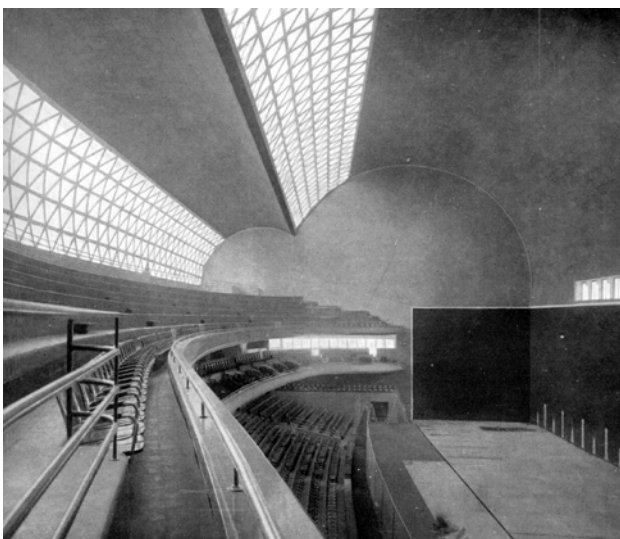
Figure 4. Fronton Recoletos. Eduardo Torroja. 1935.

One of Torroja's major works was the Fronton Recoletos (Figure 4), built in Madrid in 1935, a space covered by a thin reinforced concrete shell made up of two unequal cylindrical sectors intersecting orthogonally along a common line parallel to their axes. This asymmetrical cross section scheme was required to provide two skylights facing north: one for the playing pitch and the other for the stands.