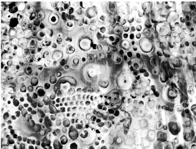
Figure 2. Visual design exercise at the MIT.

Studio work was a key feature in the methodology used in this course. Students were kept away from the traditional artist tools, such as charcoal, brush or chisel, and were encouraged to take full advantage of the possibilities offered by industrial materials, tools and techniques more akin to engineers. They were invited to observe and discover forms generated by different physical processes applied to various materials, as well as to explore variations arising from the introduction of specific organizational principles, such as grouping, contrast, similarity, pattern, rhythm and continuity, or visual elements such as shape, size, position, direction and colour. The main aim was to help them open their eyes to the aesthetic potentialities of forms coming from industrial materials and technical processes, and, in this way, to let them develop their creativity and intuition without resorting to conventional artistic means of drawing, painting or sculpture.