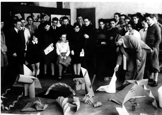
Figure 1. Josef Albers' preliminary course at the Bauhaus.

If we take as an example the exercises carried out with newspapers or corrugated cardboard (Figure 1) we find different form structuring processes, such as folding or curving, as a natural means to stiffen a pliable material. In this way, Albers pointed out, newspapers, usually used lying on a table and therefore having one side without any expressiveness, could now stand up, becoming both sides visually active. While lying, edges were hardly ever used, whereas in an upright position emphasis was laid on them. Folding and curving are principles of form that, curiously enough, will reappear further ahead, when analysing some of the works of the most innovative engineers pioneering new materials in the 20 th century.